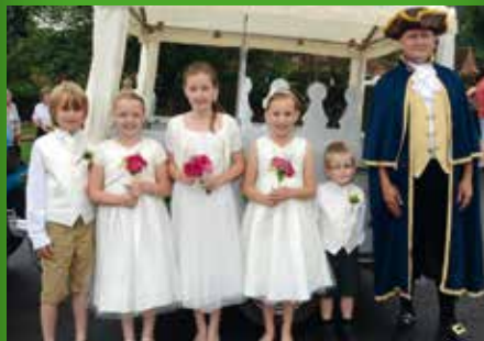
Picture shows 2014 Feast Queen and her attendants