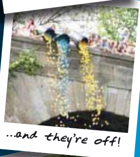
...and they're off!