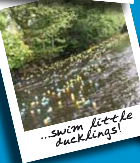
...swim little ducklings!