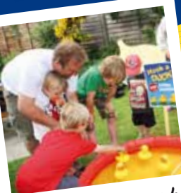
...fun at the pub